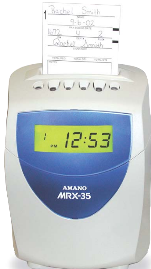
Reliable and economical.